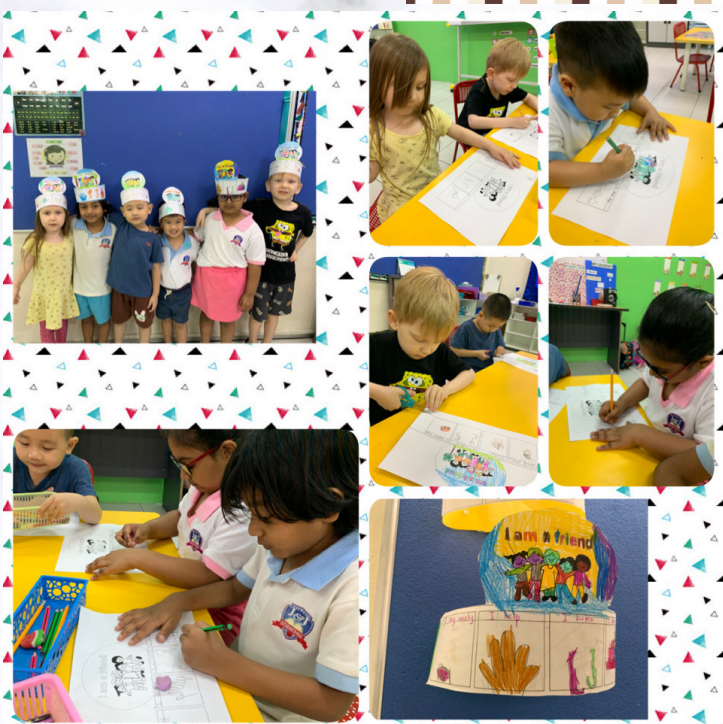
Children learned what it means to be a friend and how they can be a friend to others.