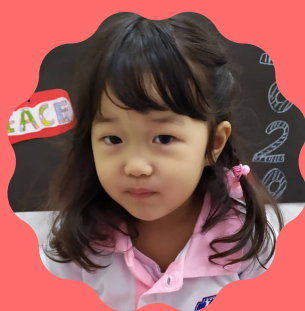
4 Peace Haruka Murakami