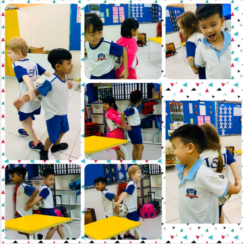
Children learned how to work together with a friend.

The theme for January 2020 is, My Family and Friends. Children learnt about their family and friends. They learnt how to behave /respond to their friends and family members. Children participated in many activities and role play on these topics. They had so much fun!