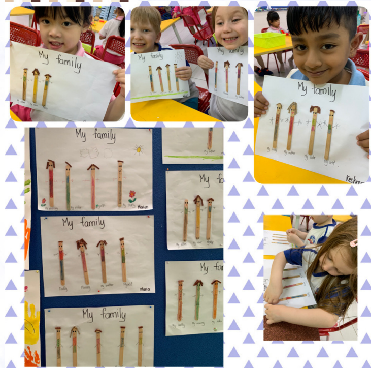
Children made family members craft using ice-cream sticks.