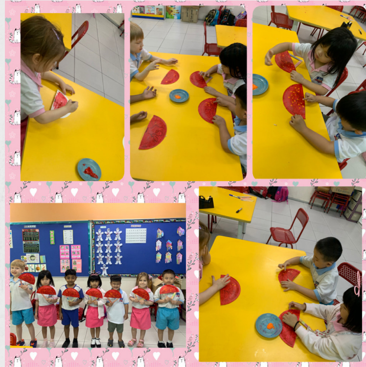
Children made a paper fan craft for Chinese New year celebration!