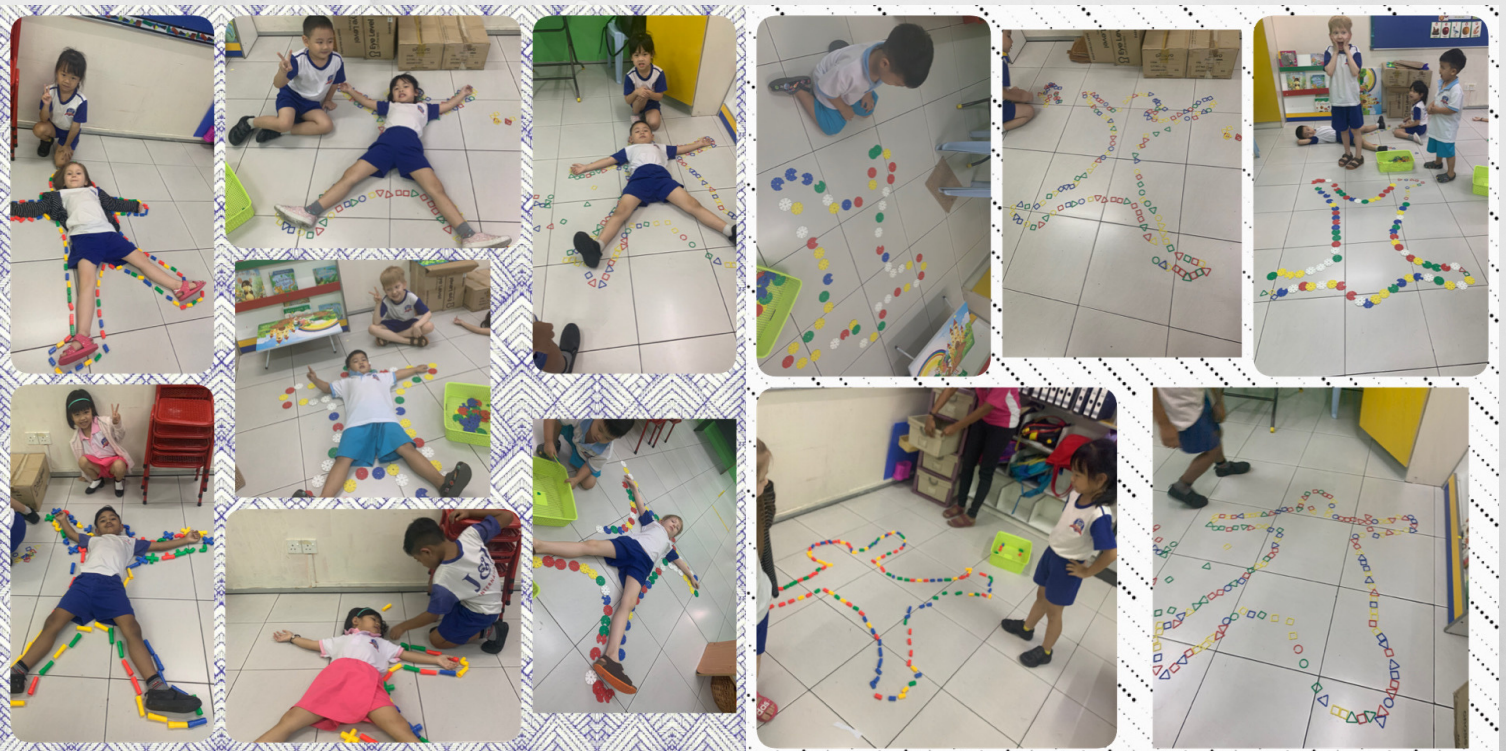
Children helped their friends build out their body shape by arranging the toys around them. Teamwork and creativity was essential for this activity!