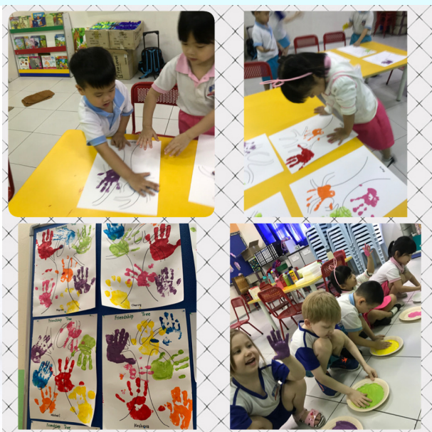
Children made a friendship tree through colorful hand imprints!